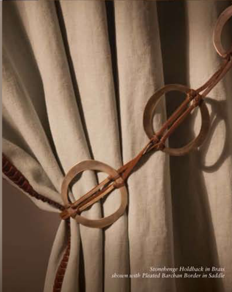
Stonehenge Holdback in Brass shown with Pleated Barchan Border in Saddle