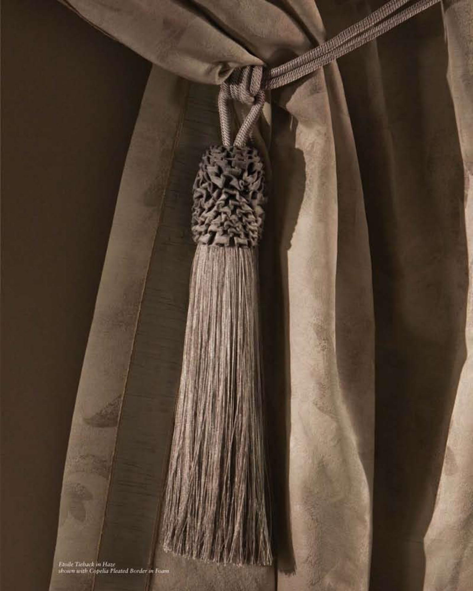
Etoile Tieback in Haze shown with Copelia Pleated Border in Foam

The AQUARELLE tiebacks have a sleeker silhouette with the luminous yarns of the tassel flowing seamlessly from a clean Lucite orb. Each of the seven colorways offers a whimsical counterpoint to this modern elan with a painterly gradation of color.