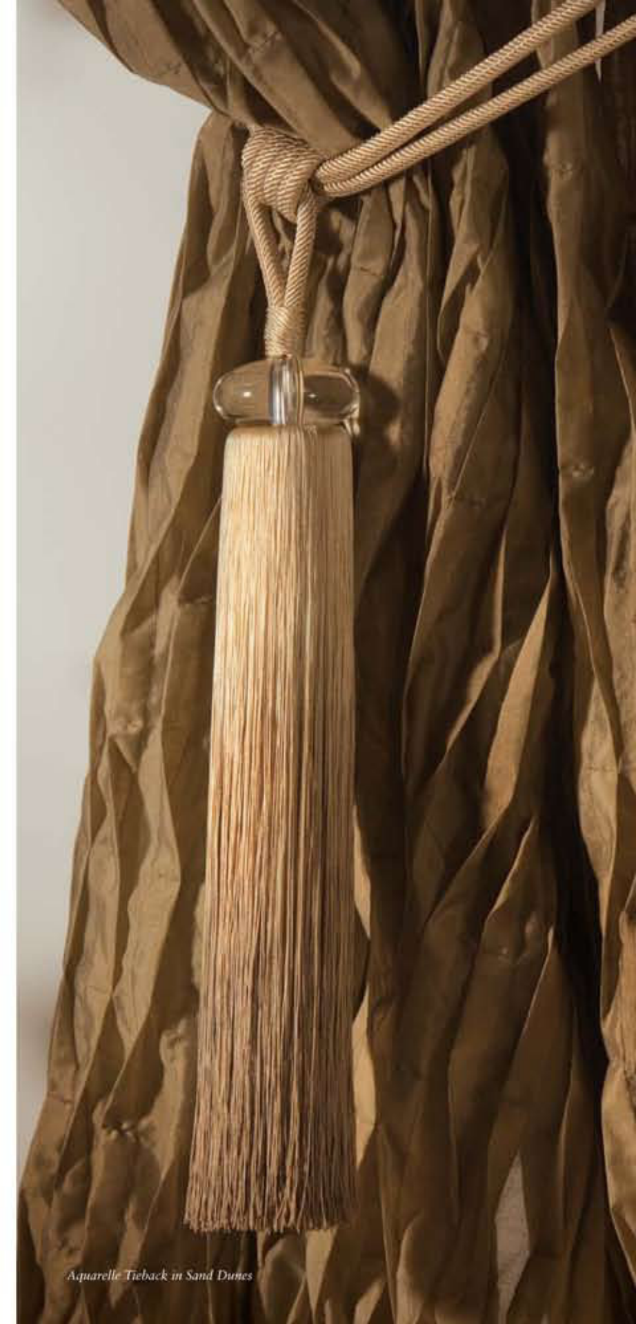
Aquarelle Tieback in Sand Dunes