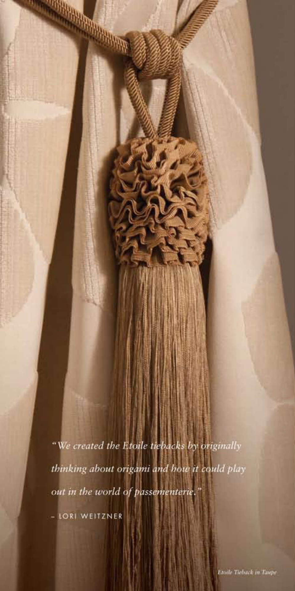
Etoile Tieback in Taupe