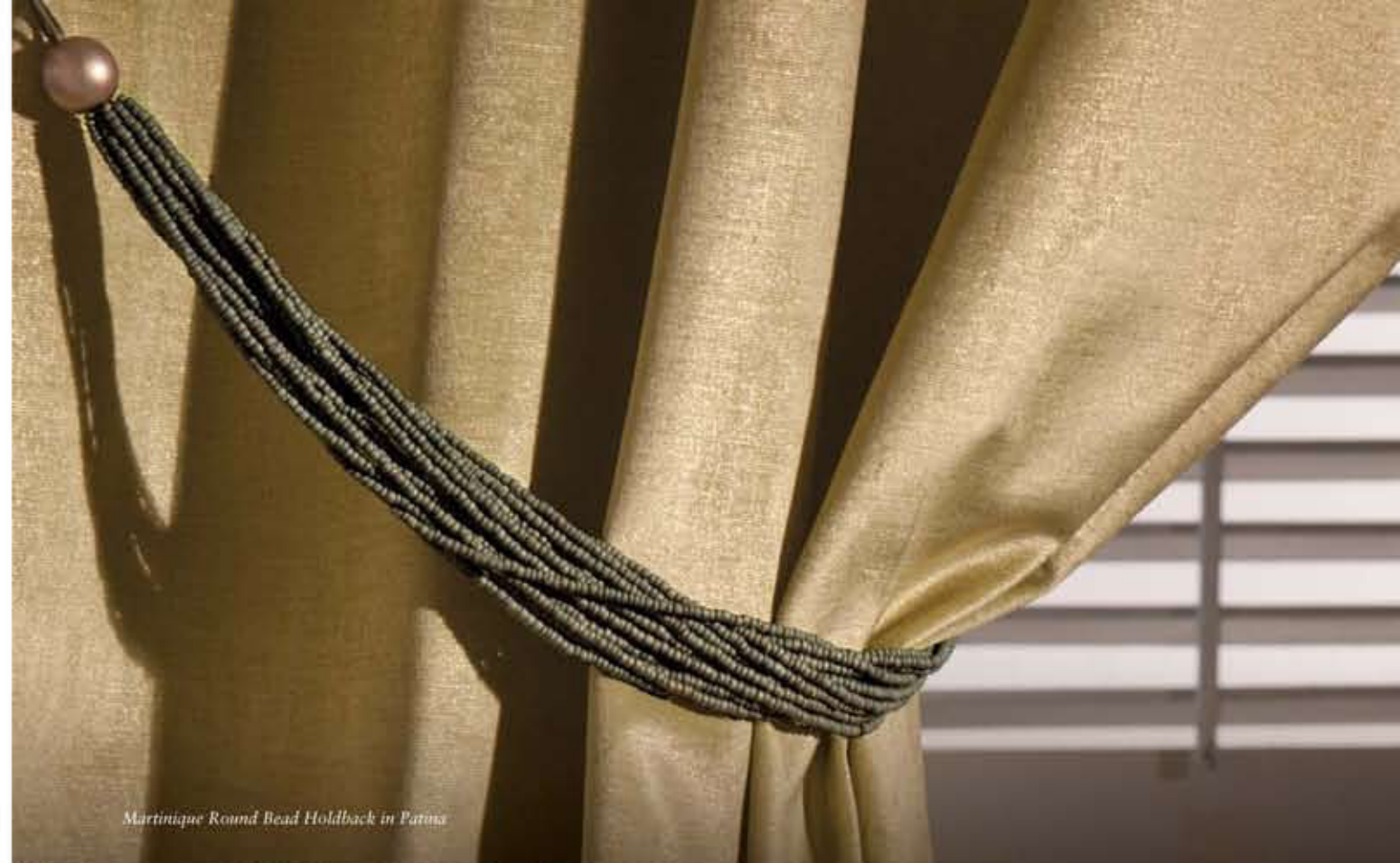
Martinique Round Bead Holdback in Patina