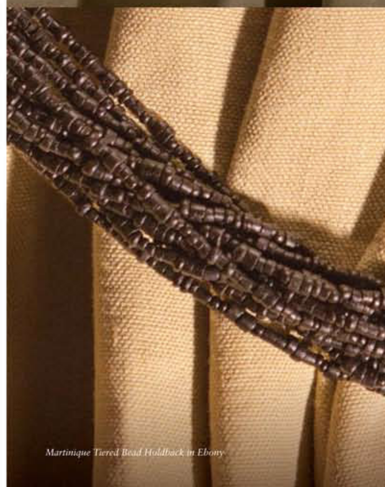
Martinique Tiered Bead Holdback in Ebony