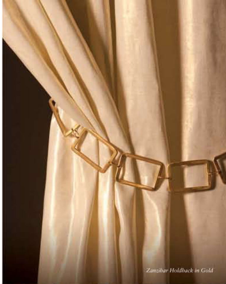
Zanzibar Holdback in Gold

Zanzibar —minimal and modern, these simple rectangular links form this holdback, a most stylish accessory for a drape. Offered in matte silver or gold metal.