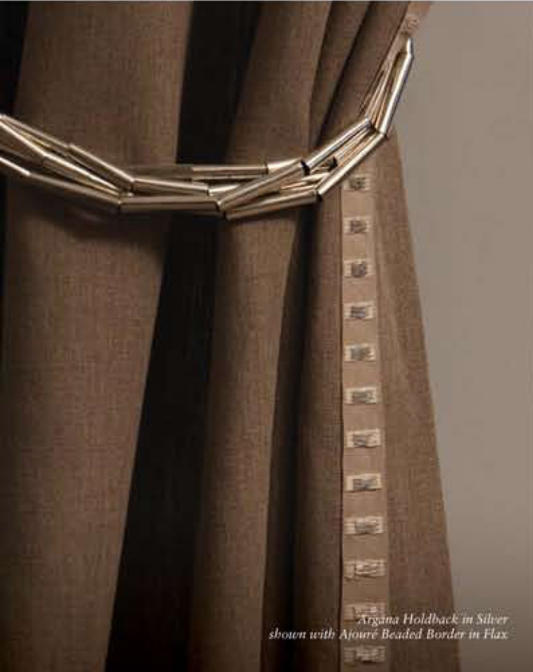
Argana Holdback in Silver shown with Ajouré Beaded Border in Flax