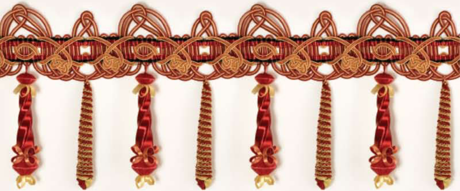
ABOVE: This 7" ornamental fringe was created based on the design of an antique trim. Its unique ornaments required extraordinary skill and handwork.