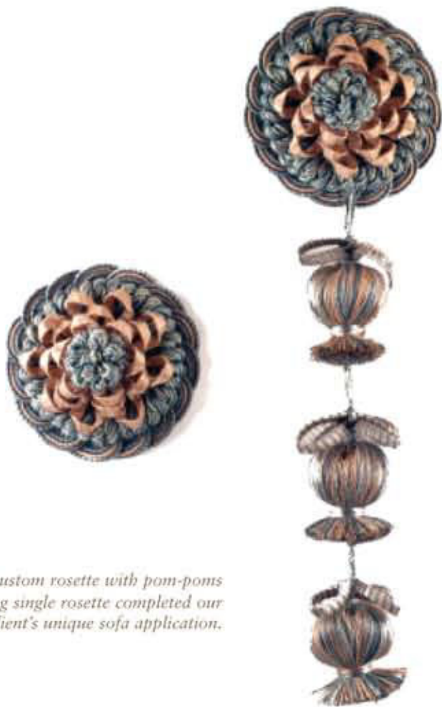
ABOVE: This custom rosette with pom-poms and matching single rosette completed our client's unique sofa application.

Once color threads are approved, production commences.