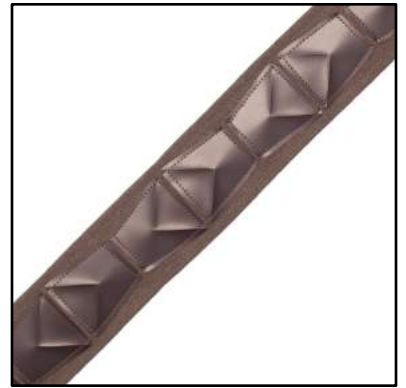
Kinetic Border in Charcoal, Jet & Cortado