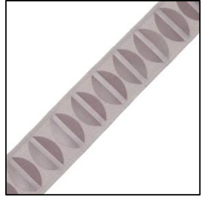
Elliptic Border in Frost, Chamois & Stone