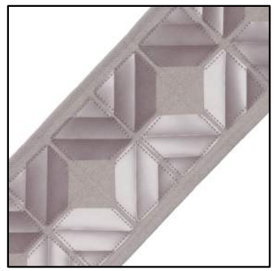
Quadratic Border in Chamois, Charcoal & Stone