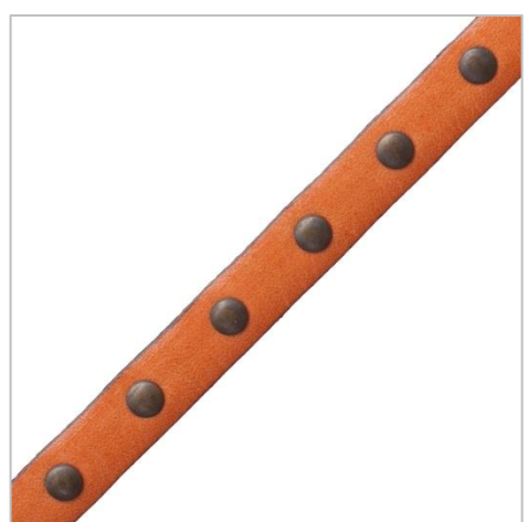
Toscana Studded Leather Border in Antique Gold on Pumpkin