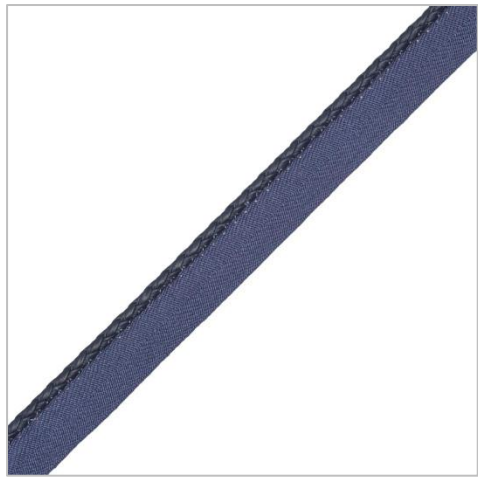
Toscana Braided Leather Cord with Tape in Midnight