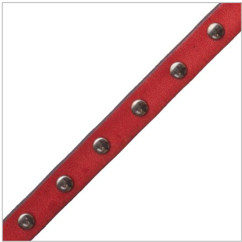
Toscana Studded Leather Border in Antique Silver on Claret