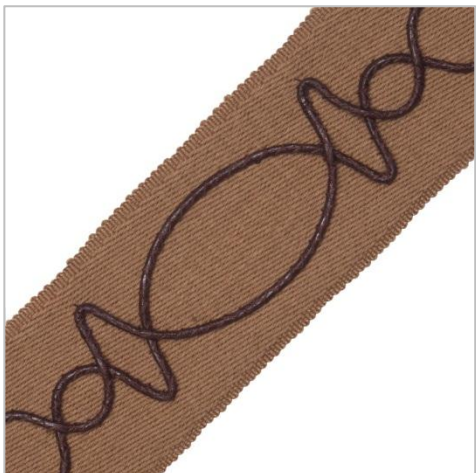
Toscana Braid in xxx