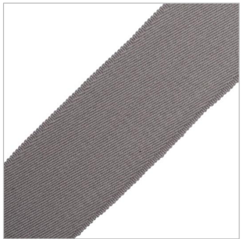
Toscana Braid in xxx